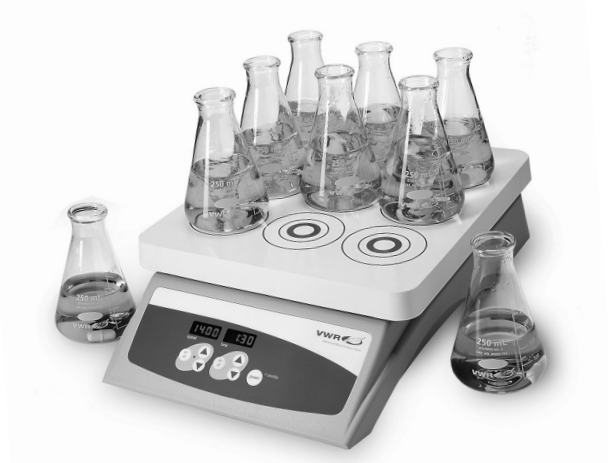
VWR Advanced Multi-Position 9