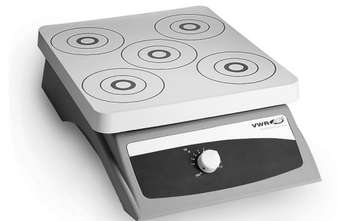
VWR Standard Multi-Position 5